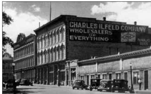
New Mexico Jewish Historical Society