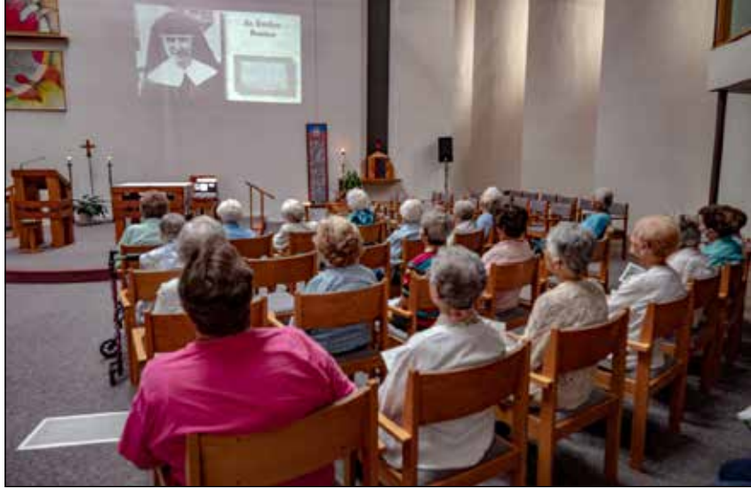
Above, Victory Noll Sisters watch a virtual tour of the OLVM Cemetery. Below, readings and music were part of the Memorial Service.

During the service, a virtual tour of the OLVM Cemetery was shown, a video presenting a photo of each deceased Victory Noll Sister and a picture of her headstone. ❖