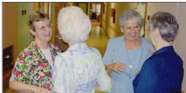
Members of the new OLVM Leadership Team (above) and the previous team (left) meet with Sisters and co-workers gathered following the installation program Aug. 6 at Victory Noll.